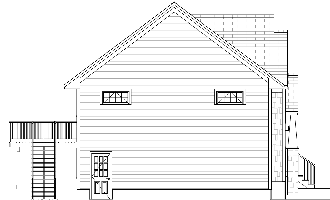
Left Elevation Scale: 1/8" = 1'-0"