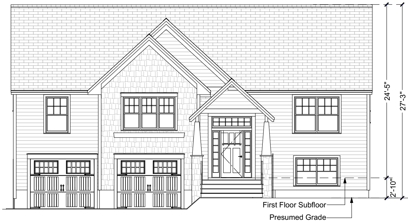
Front Elevation Scale: 1/8" = 1'-0"