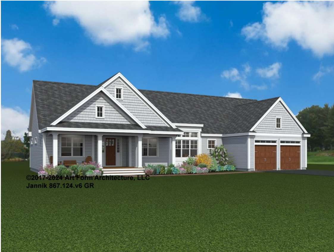
Jannik 867.124.v6 GR