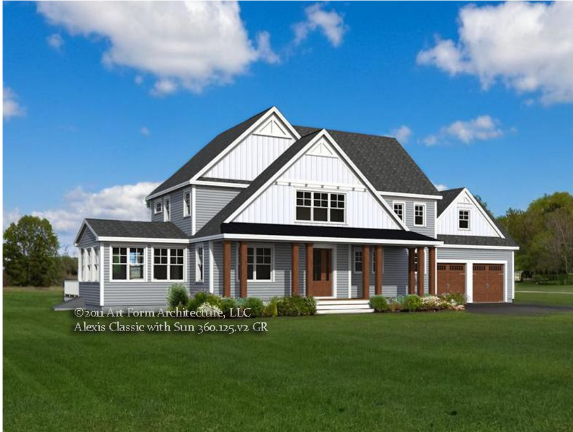
©2011 Art Form Architecture, LLC Alexis Classic with Sun 360.125.v2 GR